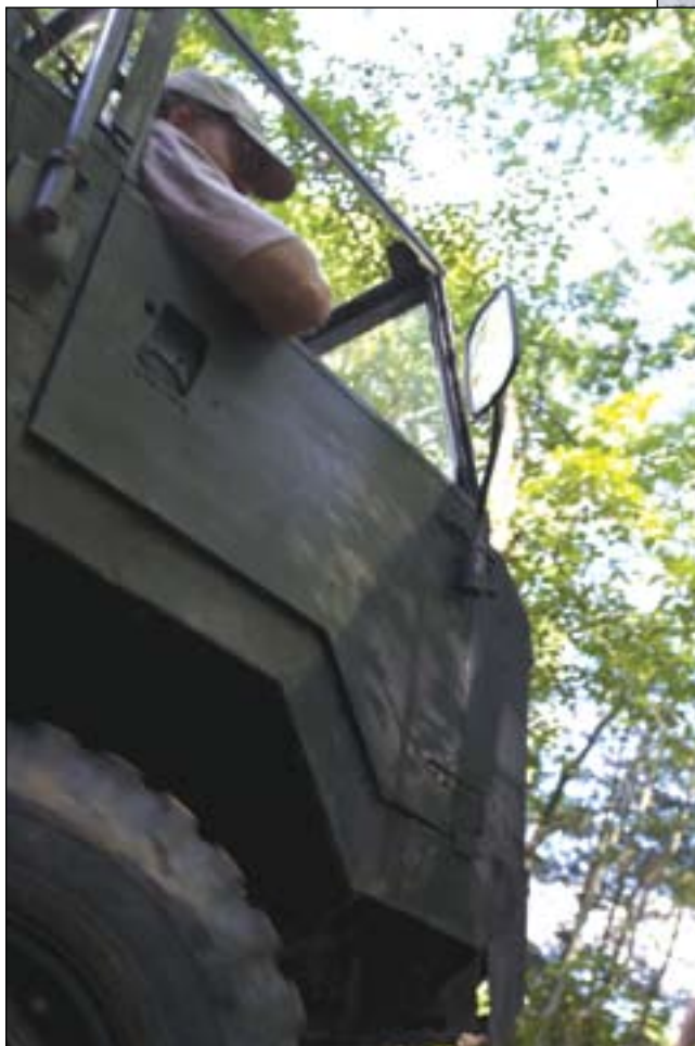
Riding high at the RTV