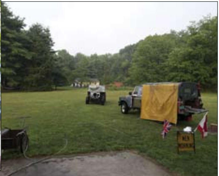
The men are working elsewhere at the moment