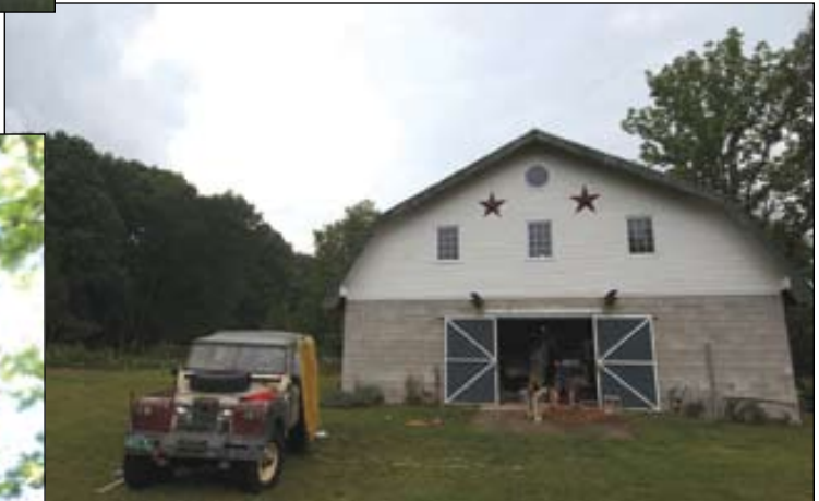
Ben's garage in NJ, home of Blacker than Night