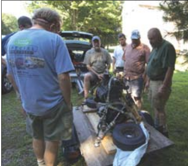
Planning the next step