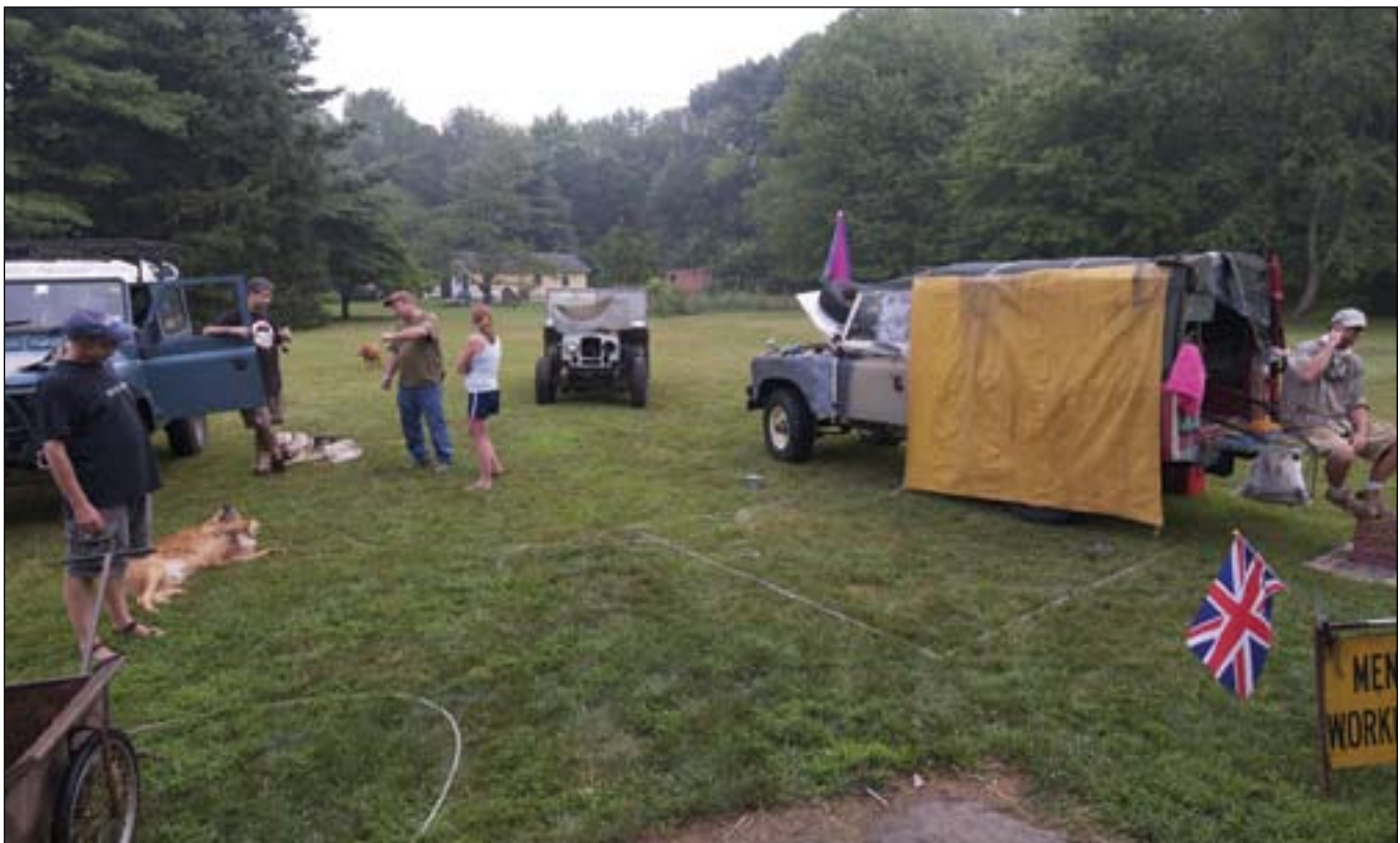
Circling the wagons (Blacker than Night – see more photos on page 5)

1300 Michael Street, Ottawa, ON K1B 3N2 Tel: 613-722-7533 Fax: 613-722- 868