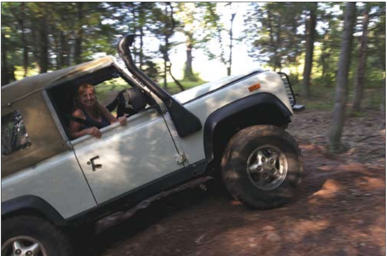
Enjoying the climb (MORE PHOTOS ON PAGES 5)