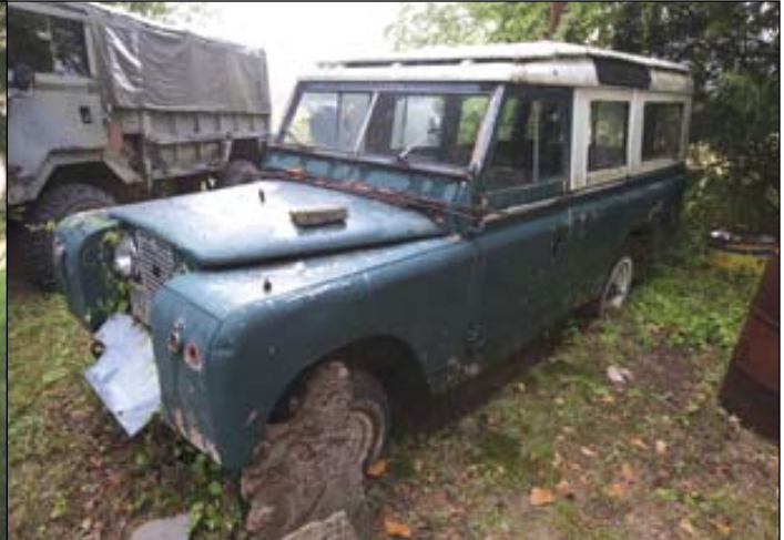
One of the vehicles awaiting its turn