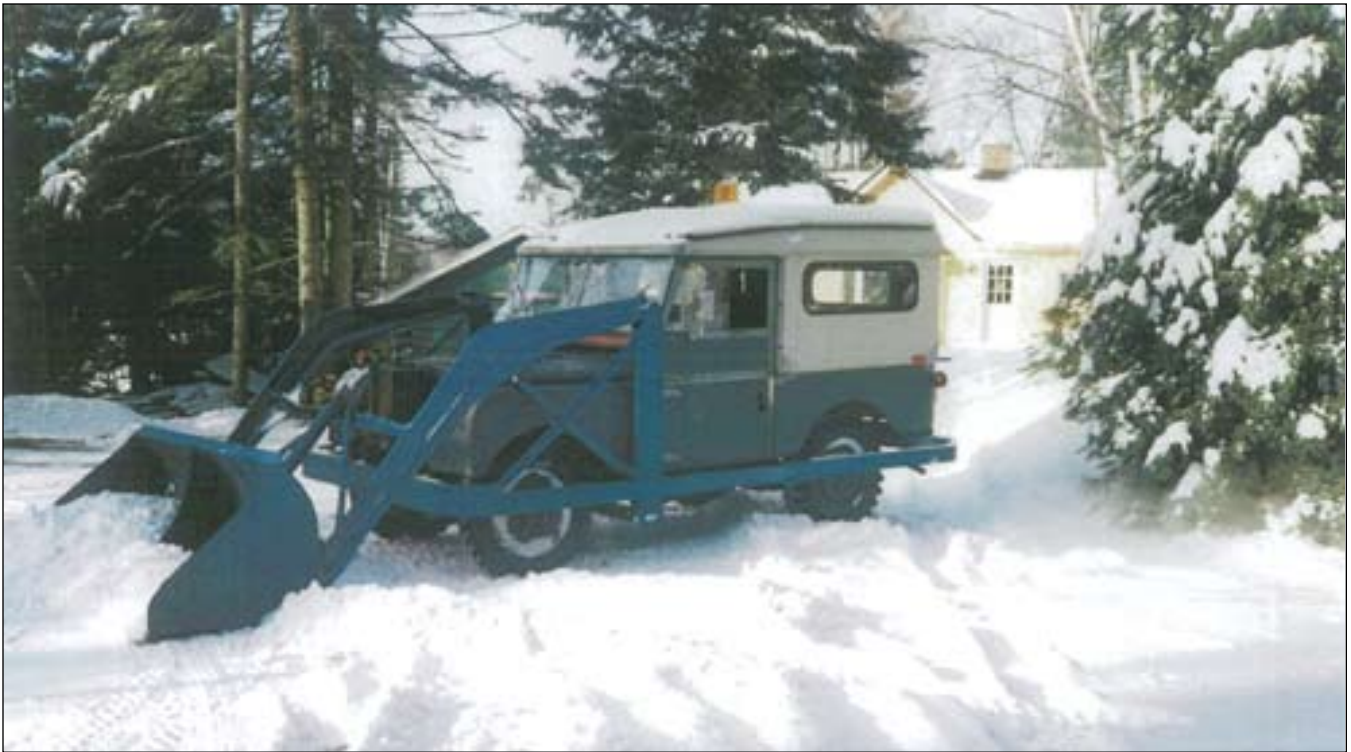
This Series I [1957 I believe] spent most of its life, up until a few years ago, clearing snow from a private roadway in Val Des Lac, Quebec. It now belongs to someone in the Trois Riviere area.