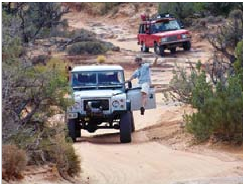
J-L in Moab

We are also OVL R Club Members = Enthusiasts serving Enthusiasts!