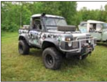
Dom Perodeau's Series/Disco hybrid.