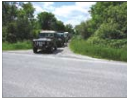
Where the rubber hits the road.