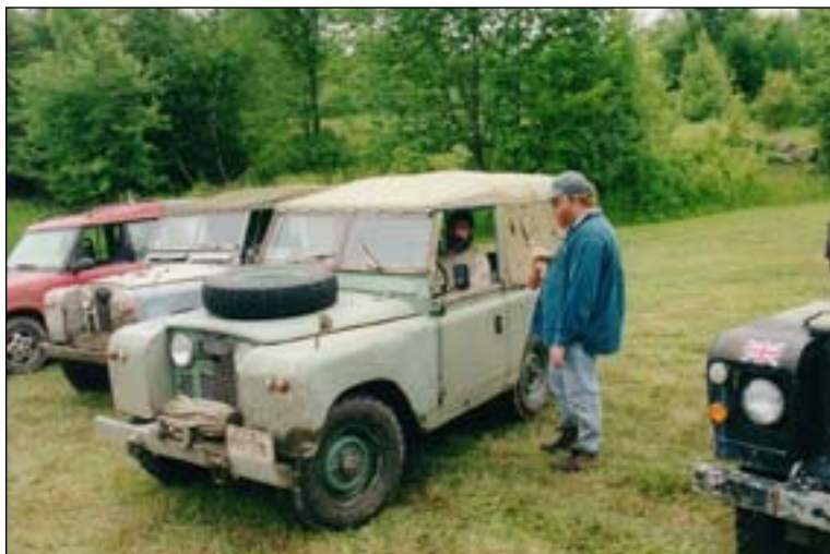
Mike Loiodice and his SILA 88 (2001 BP)

Series: 12 [3 Series I (80, 86, 107), 5 II/IIA (3 88, 2 109), 4 SIII (2 88, 2 109)]