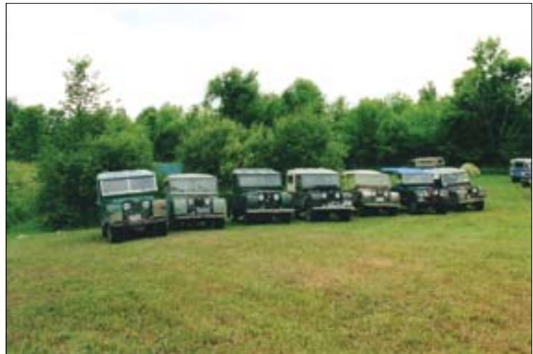
The lineup of Series Is (2001 BP)

I noticed something interesting at the Birthday Party this year. It was the lack of Series Land Rovers. When I first got into Land Rovers and went to my first Land Rover Rally (Atlantic British in 1991) all one saw was Series with a few Range Rover Classics. In 1992 I saw my first Defender 110 at a rally (Rovers North). Discos and D90s came soon thereafter. In the last 18 years, the ratio of Series to new vehicles has decreased. By the end of 1990s it was certain that there would be more coilers at an event than Series. The number of Series soon became a small minority outside of OVL R events.