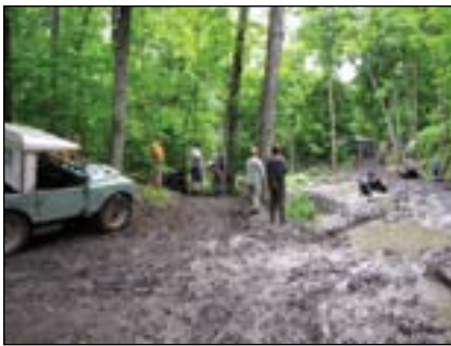
What we saw at Bolton Creek.