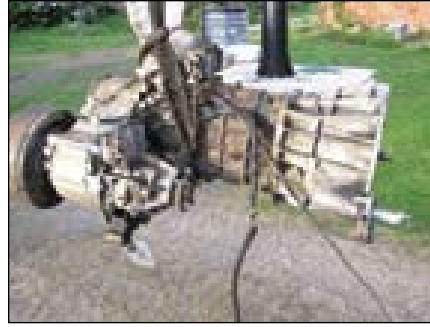
R380 and T/C on the hoist

Right after the Oiler last year, I found some borrowed space (that would be the 4th dimension), and started in earnest on page one of the instructions I had found earlier.