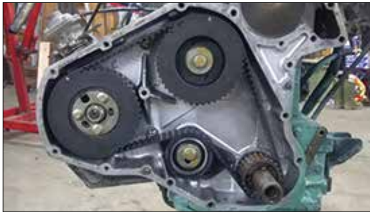
LandRoverPilot: New Belt in the tdi!