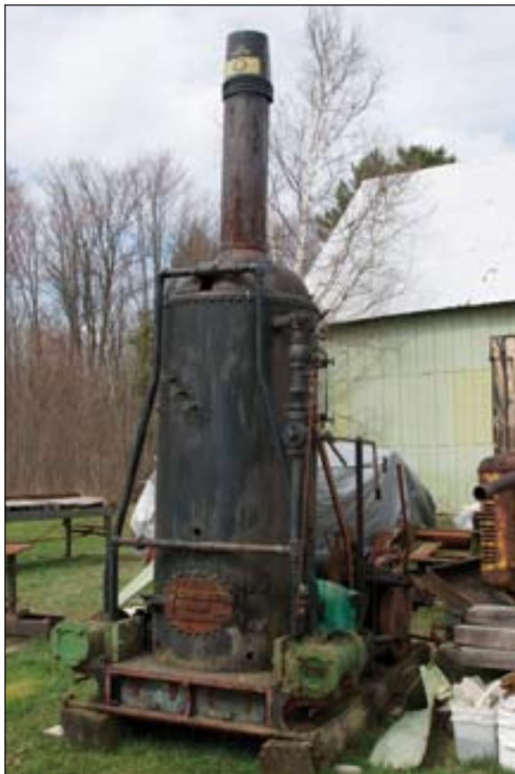
The Age of Steam makes a comeback