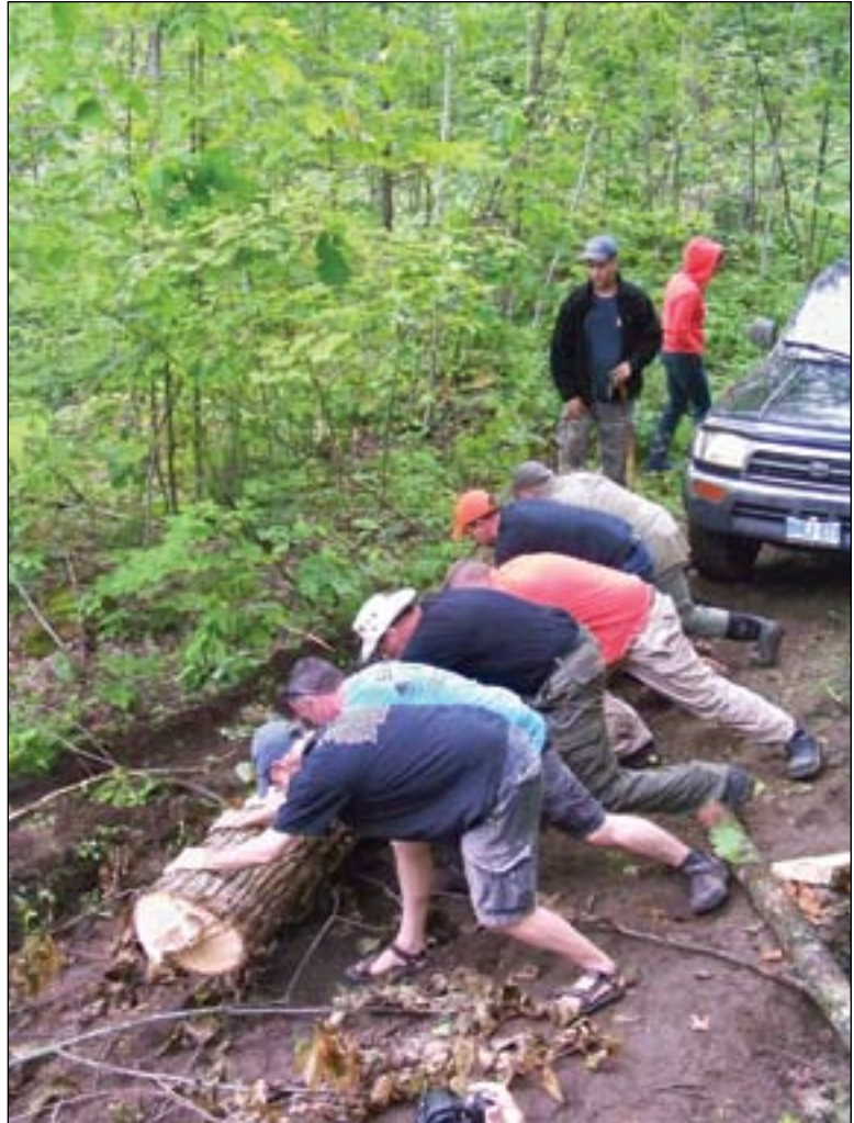
All work together