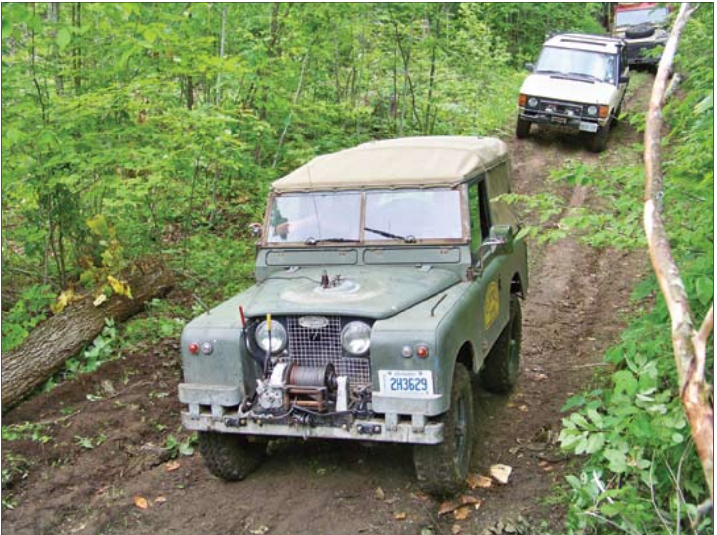
Charlie's 88, light off road (see pages 5-9 for article and more photos)