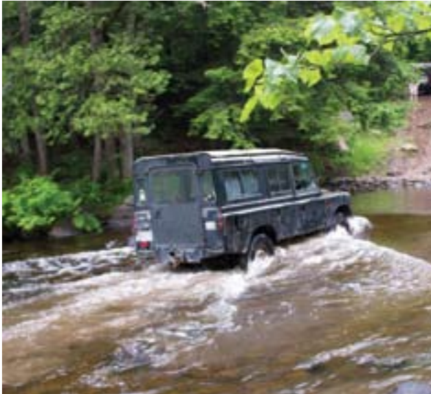
BGB wading through Bolton Creek