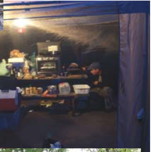
Some people are just TOO prepared - look an oven