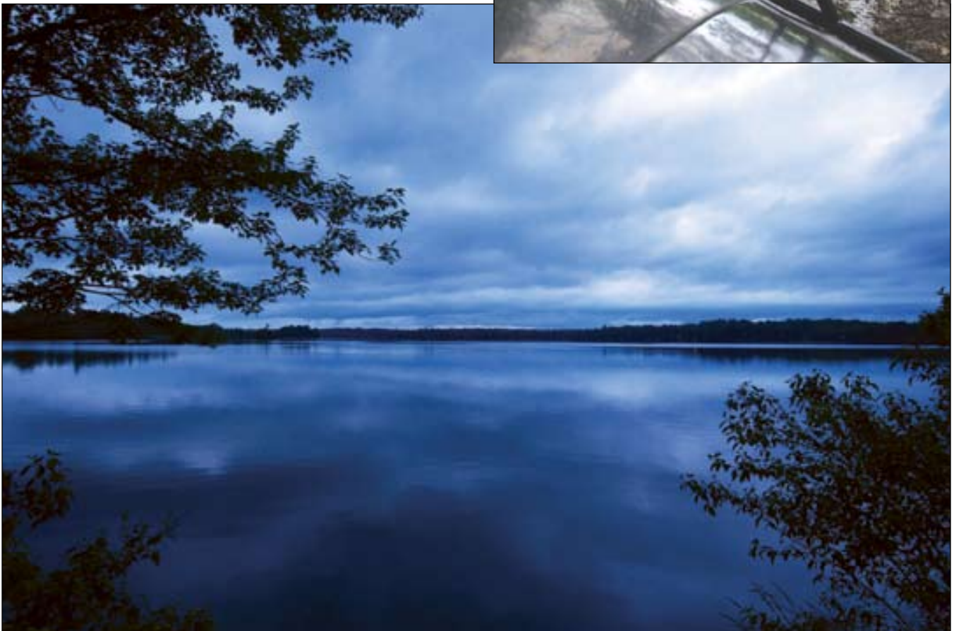
Part of the reason we go to Silver Lake