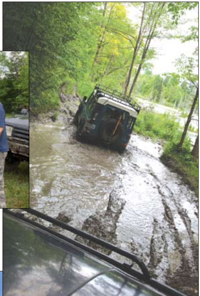
On Dodd's Lake trail (Light-Offroad)