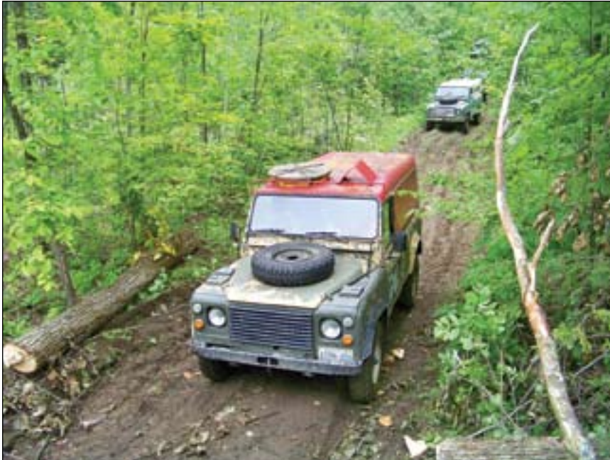
110 (light off road)

Yes the rain came. Most of it was Thursday night. Other than that there were showers here and there. Rain was more of a nuisance than anything else.