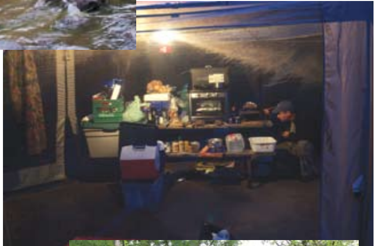
Some people are just TOO prepared - look an oven