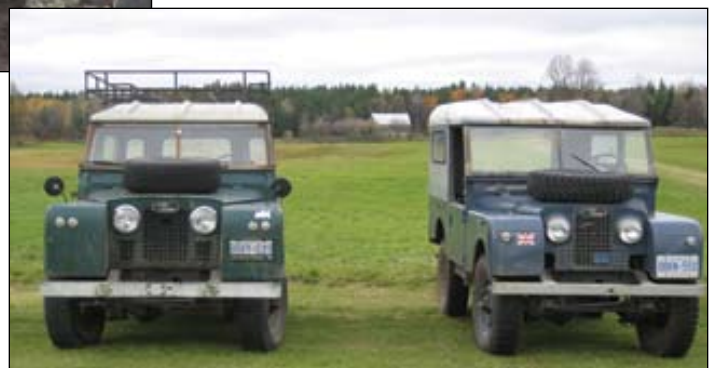
Was it something I said?