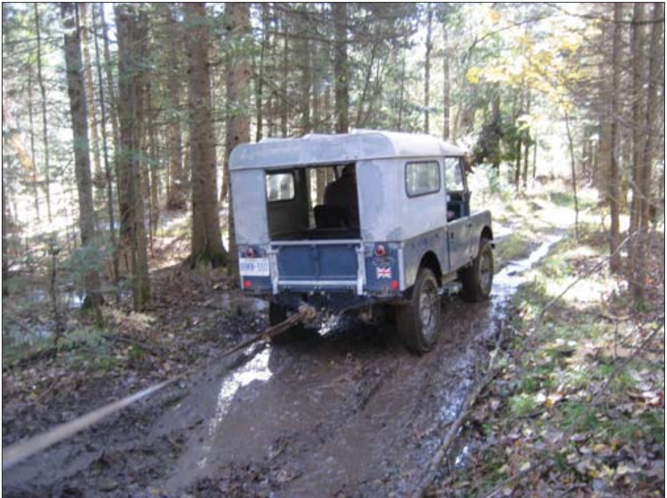
Andrew to the rescue. (see more photos on pages 5-6)