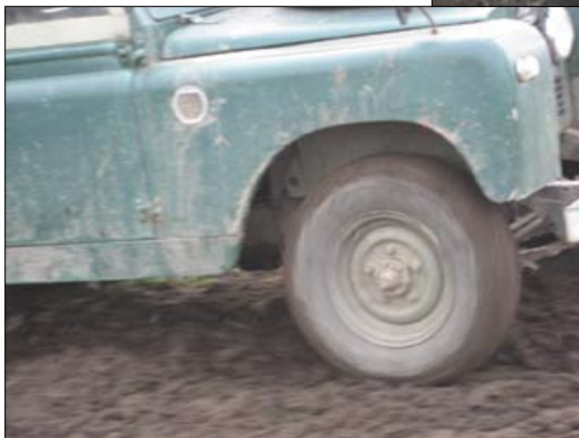
Lenny spins to the top