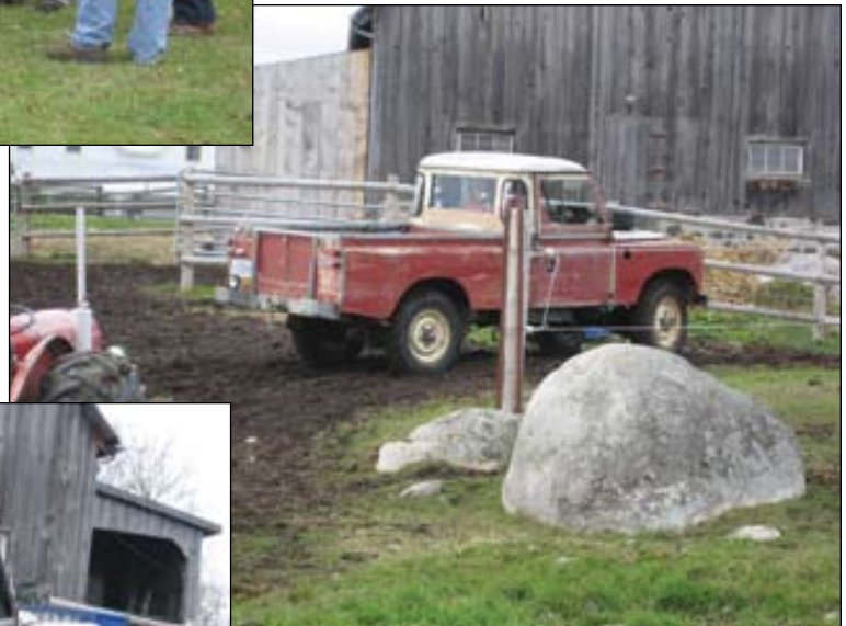
Sedgwick leaves the stable.