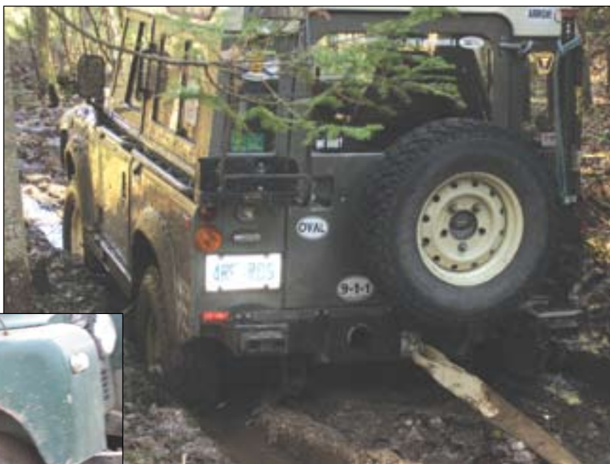
Stan in a pickle.