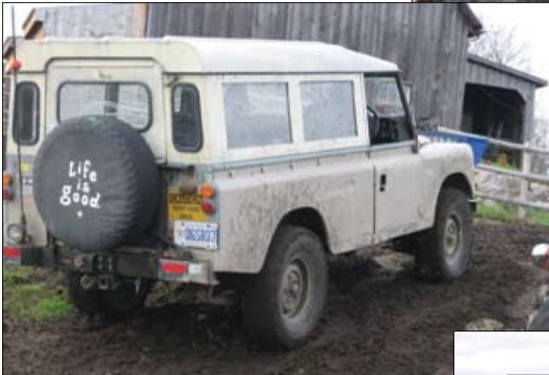
Fergie's message says it all