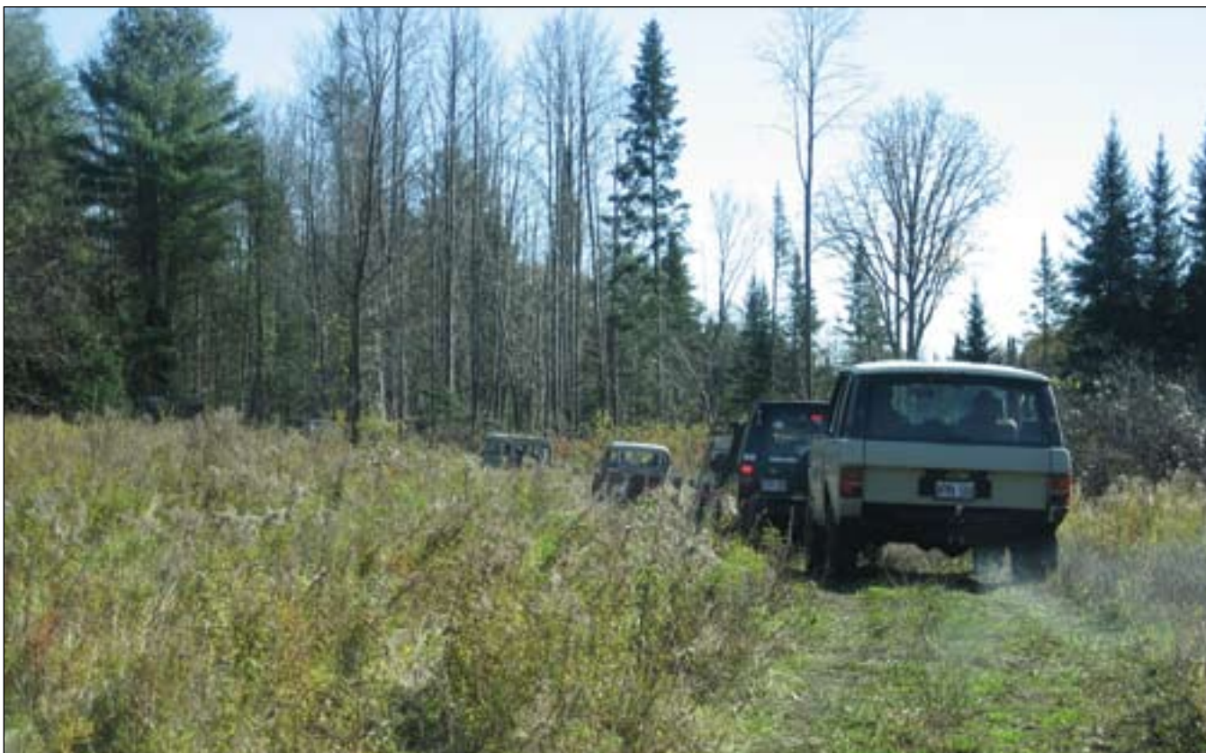
The trail for the most part.