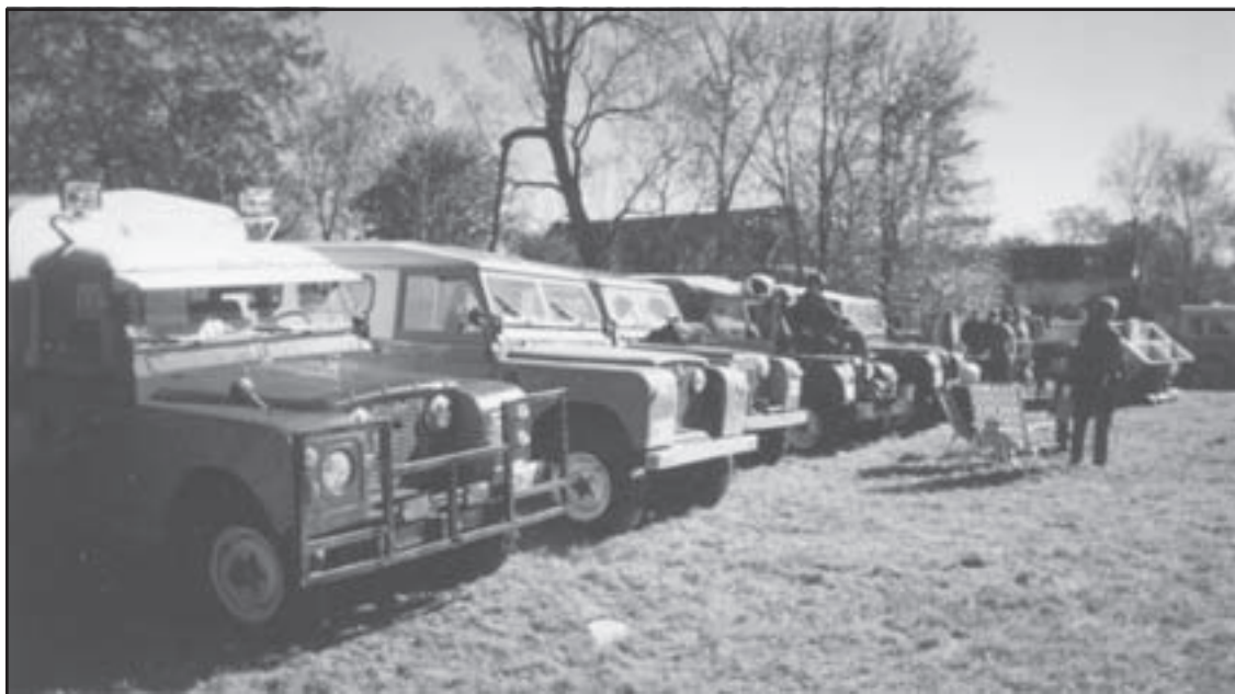
A line-up of sun bathing beauties back when the sun shone for the annual oiler.

PHONE HOURS: M-F 8:00 AM - 5:30 PM, SAT 8:30 AM - 12:30 PM EST • FAX: (802) 879-9152 1319 Vermont Rt. 128, Westford, Vermont 05494 • USA email@roversnorth.com