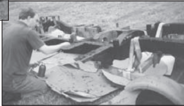
From 1995, the last time Dixon's BGB got the frame-off treatment.