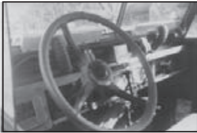
Sit down, keep quiet and hold on to this HUGE steering wheel.