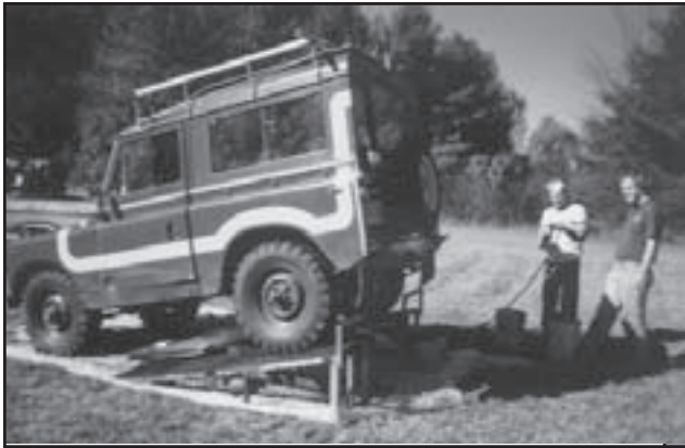
From 1994, before Yves and Dixon bought suits.