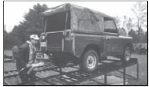
From 1995, first we fumigate, then we oil.