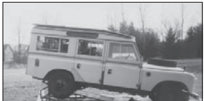
Nada, Nada, Nada. Now, yadda, yadda yadda.