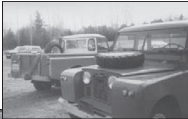
These two handsome items have since had three offspring.